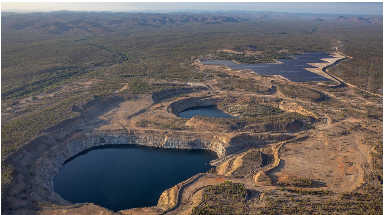
Fig. 1. Kidston Clean Energy Hub.

Genex has a development pipeline of up to 770MW of renewable energy generation and storage projects within its portfolio, underpinned by the Kidston Clean Energy Hub in far-north Queensland (Kidston Clean Energy Hub). The Kidston Hub is comprised of the operating 50MW Kidston Stage 1 Solar Project (KS1), the 250MW Kidston Pumped Storage Hydro Project (K2-Hydro), the multi-staged integrated Solar Extension Project of up to 270MW Kidston Solar Extension (K2-Solar) under development and the Kidston Stage 3 Wind Project of up to 150MW under feasibility review. In addition, Genex has acquired the 50MW Jemalong Solar Project (JSP), located near Forbes in NSW, which is also under development.